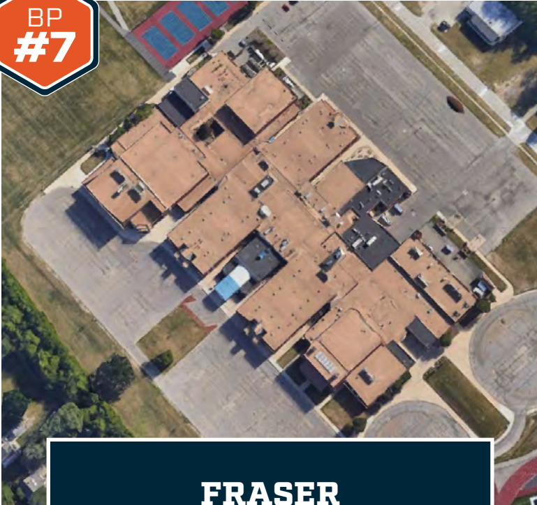
FRASER HIGH SCHOOL

Roofing Work Architectural, Mechanical + Electrical Upgrades