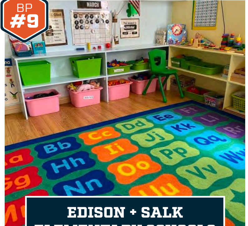
EDISON + SALK ELEMENTARY SCHOOLS + DOOLEY CENTER

Roofing Work Architectural, Mechanical + Electrical Upgrades