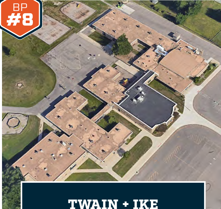
TWAIN + IKE ELEMENTARY SCHOOLS

Roofing Work Architectural, Mechanical + Electrical Upgrades